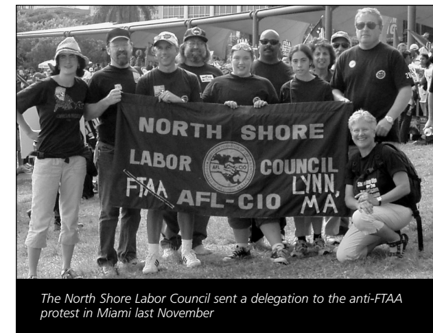
The North Shore Labor Council sent a delegation to the anti-FTAA protest in Miami last November

Bush's proposed changes in immigration policy have sparked criticism from both labor and immigrants rights organizations. Immigration policy affects not only the lives of the large numbers of undocumented immigrant workers, but also the labor movement's ability to organize and represent all workers. As globalization has lowered the standard of living of workers in many countries, the number of workers who come to the United States for work without documentation has risen dramatically. We need to help our members understand how the low pay, poor working conditions and lack of labor rights for these undocumented workers affects their working conditions and pay, as well