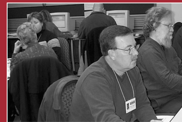
Participants in Strategic Research class practice finding information on all sorts of companies and other institutions.