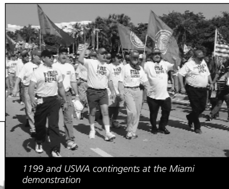
1199 and USWA contingents at the Miami demonstration

We have a commitment to work with other labor education resources to offer programs on these topics. Look at the Spotlight and Resource sections of this issue of The Bulletin for more information.