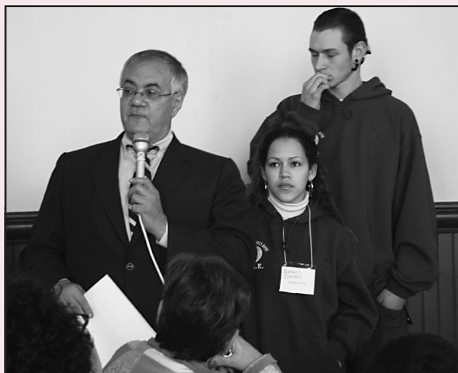
Two members of New Bedford YouthBuild ask questions of Representative Barney Frank at the UMass Dartmouth Future of Work Conference.