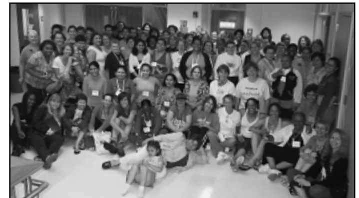
Women in Leadership Development Summer Institute participants from June of 2006 at Wheaton College

The Labor Extension Program has been doing political education programs based on the SEIU/UFE model of Shrink-Shift-Shaft (see Labor Extension Bulletin Spring 2004, Vol. 5, #2) for several years. Shrink-Shift-Shaft offers a clear and easy-to-understand framing of the right-wing corporate agenda and suggests a way for activists to have ongoing political conversations with members about issues and candidates, based in a discussion of union values. It suggests that our task as activists is to talk to our members about our issues and candidates in a way that is rooted in union values, such as solidarity, respect, dignity, equality, fairness, justice and working peoples' right to a decent job,